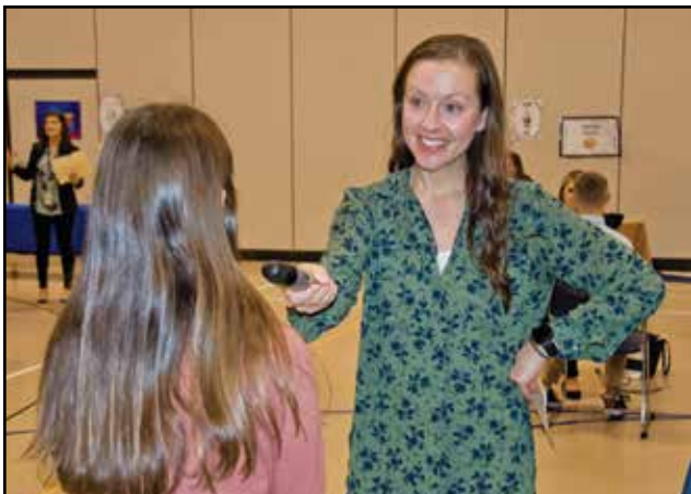
An interview with the media.