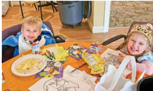
Our Halloween Party was a huge success! The best part about it? Seeing how happy our residents were to see not only their families come together, but the little faces in their costumes run around. Next up- Thanksgiving!!