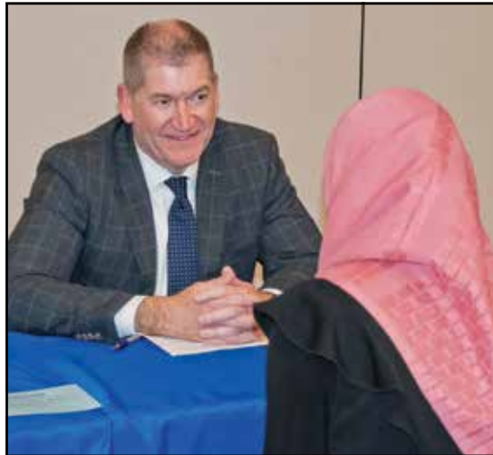
An interview with Mayor Kevin Corcoran.

The top 32 students will then each select a local non-profit for which they feel would benefit from a $500 donation. They will present to a panel of representatives from a local business who are willing to make this donation to the winning student’s non-profit.