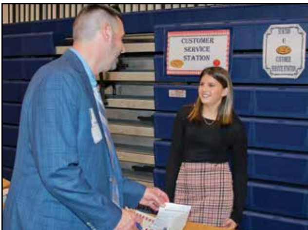
At the Customer Service Station.