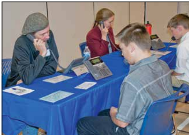
Basic telephone etiquette and appointment making.