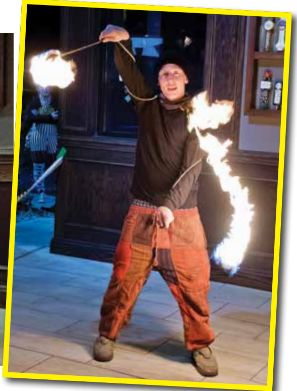
Halloween was a scream at Bistro83 on Sunday, Oct. 30, as the upscale restaurant hosted its first-ever Carnevil & Fun Fair. Guests arrived decked out in their scary best and enjoyed a night of fun, fear and fellowship and food. The Ohio Burn Unit fire team fired up the crowd with an amazing performance