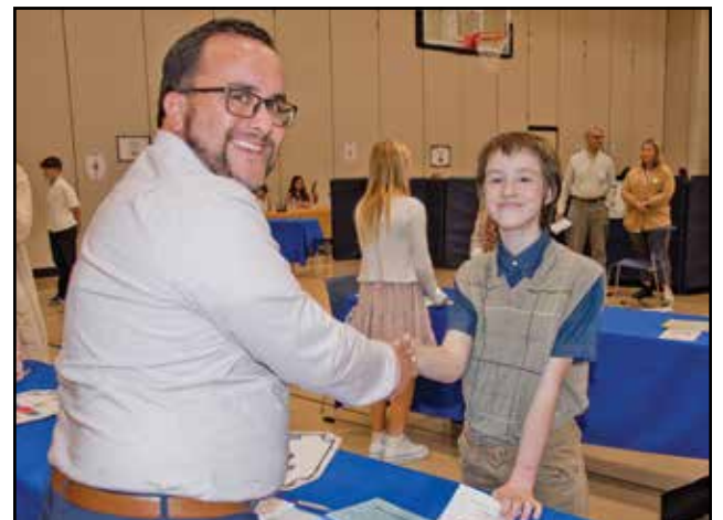
The universal language of shaking hands.