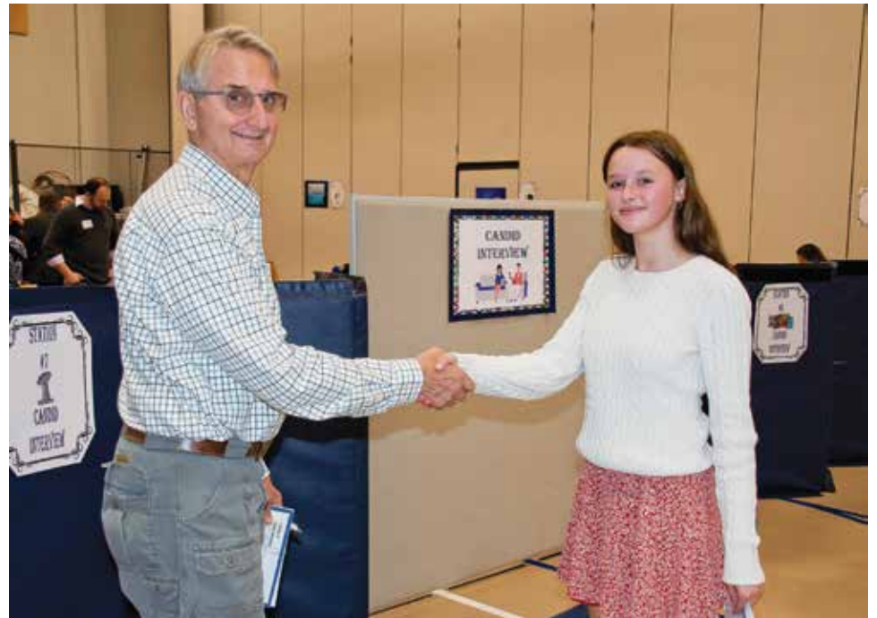
This program is designed to teach students life skills such as learning how to shake a hand, order from a menu at a restaurant, make an appointment over the phone, interview for a job, among other things.