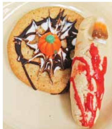
It wasn't all Tricks at Danbury North Ridgeville. Delicious treats were also enjoyed!