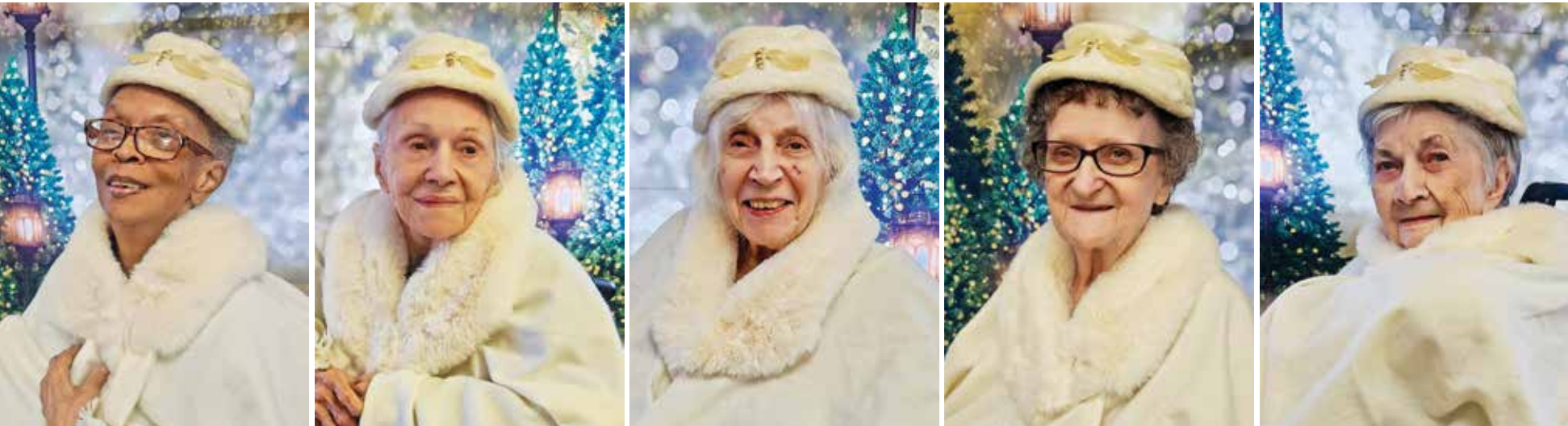
We loved getting dolled up for a Winter photo shoot!