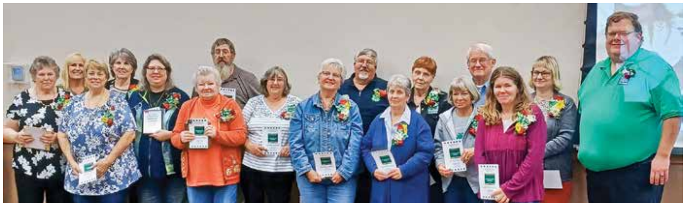
4-H Volunteers recognized for 26 years or more.