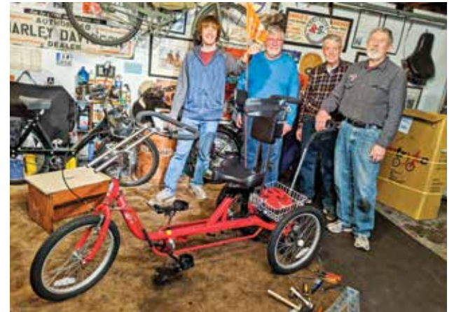
The North Ridgeville Review welcomes letters to the Editor as well as news items. Please send all information by e-mail or typed. You must include your name, address, phone number and signature for verification. All items should be sent to: North Ridgeville Review c/o The Villager Newspaper 27016 Knickerbocker Rd., Suite #1, Bay Village, OH 44140

The Publisher is privileged to revise or reject any advertisement which is deemed objectionable, either in subject matter or phraseology, or opposed to public policy or the policy of the paper. The Publisher shall not be held responsible for typographical errors except to adjust the charge for the first insertion only, by a space credit (in excess of contract) to be used the following issue. Errors must be reported immediately and space credit will be limited to such portion of advertisement as may have been rendered valueless by the error. Please check your advertisement and in the event of error notify the paper. The Publisher will, upon request, furnish Advertiser with a letter so worded as to relieve the Advertiser from responsibility for the error. The Publisher does not assume responsibility for an error in an advertisement other than the above stated.