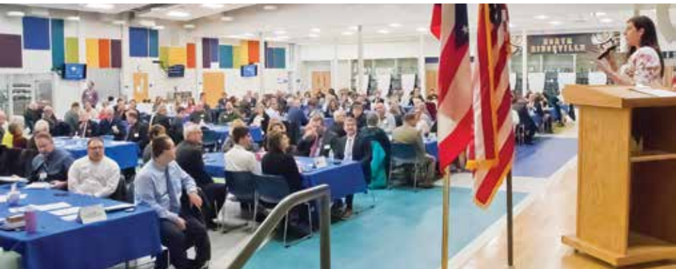
North Ridgeville Academic Center

Calling himself the “Number One cheerleader in town,” he described his run for office as the toughest job interview he has ever faced. But the honor of serving as mayor is, he said, “an awesome opportunity and responsibility.”