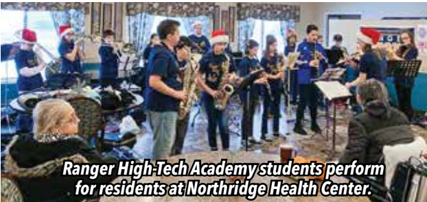
Ranger High-Tech Academy students perform for residents at Northridge Health Center.

This week, students in the 5-8 choir and 6-8 band from Ranger High-Tech Academy performed holiday songs for residents at Northridge Health Center, O'Neill Healthcare, and Life Care Center. What a great job by the students to spread holiday cheer!