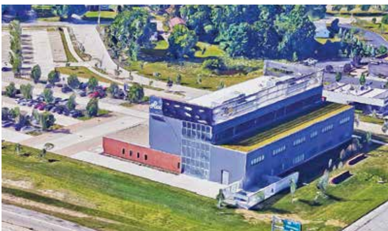
LCCC University Partnership Ridge Campus, 32121 Lorain Road North Ridgeville, (440) 366-4800, LorainCCC.edu/Ridge

UPRC launched on Jan. 7, 2013. In its seven years, 3,500 LCCC students have enrolled in courses at UPRC. Another 400-plus students take