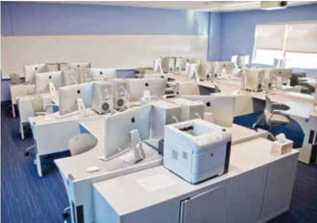
State-of-the-art computer labs