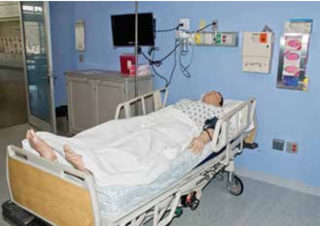
Patient Simulation Learning Center

LCCC and UPRC have formulated a groundwork of success that is both local and affordable.