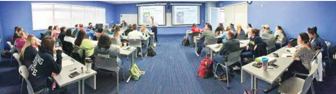
Want to see what LCCC UPRC has for you? Please visit LorainCCC.edu/Ridge .

Associate of Arts and Associate of Science degree programs are transfer degrees designed for students who continue their education after LCCC. The degrees do not have specific majors, but can be tailored to apply to different majors at the bachelor's degree level at the LCCC University Partnership and other universities.