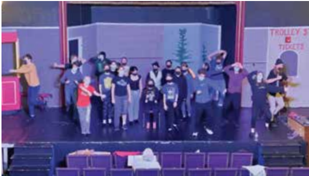
The ensemble won the award for 'Excellence in Dance.' 'The talent of each and every one of these kids are immeasurable and the effort they put into every second they're on stage is incredible! Congratulations everyone!'

Olde Towne Hall Theatre is North Ridgeville's award-winning community theatre at 36119 Center Ridge Road.