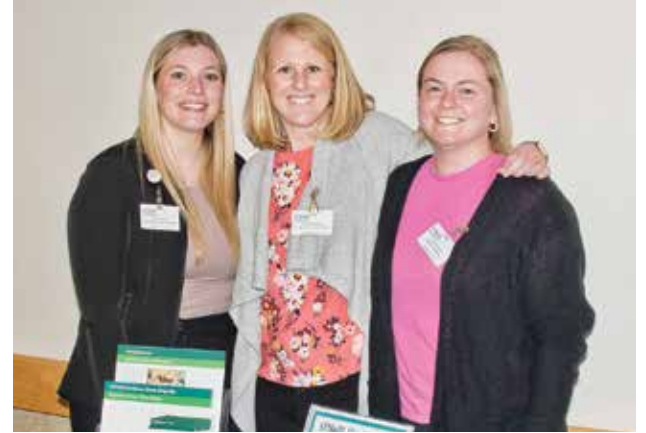
The O'Neill Healthcare team. Look for more Lunch and Learns coming up.

Aligned Health Center is located in Westlake and specialized in Massage Therapy, Chiropractic Biophysics and Regenerative Medicine. They are located at 26933 Westwood Road, Westlake. Tired of joint pain? Give them a call at (440) 385-7357.