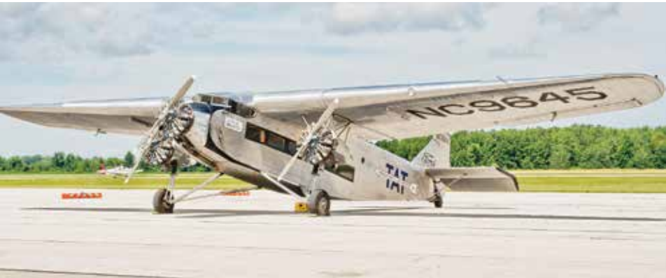
The Ford Tri-Motor 5-AT-B between flights. Passengers were given an experience of a lifetime as the plane soared in the sky above Lorain County this weekend.