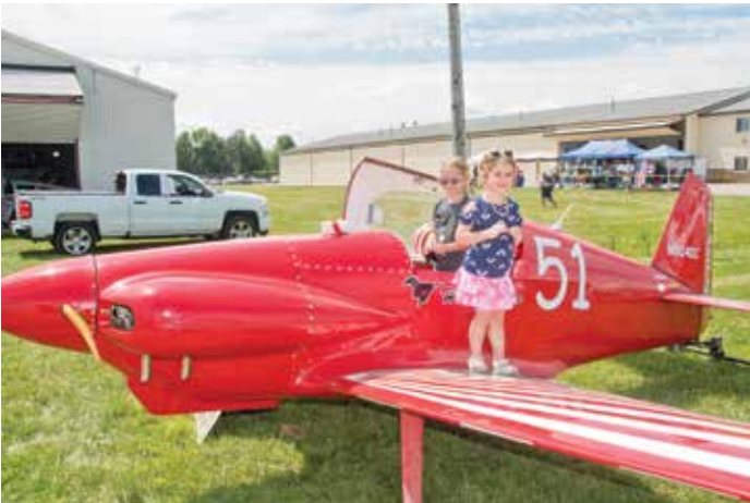
Young aviators get a chance to have fun at Discover Aviation Day. Seventy youth were given free Young Eagle flights from local aviators.