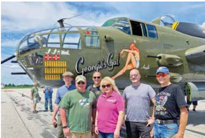
Commissioner Hung with aviation enthusiasts in front of a vintage WWII B-25 bomber nicknamed Georgie's Gal.

Lorain County Regional Airport was busy this week-end with aerial and static displays as Discover Aviation Day brought in aviation enthusiasts and those wanting an up-close look. The blue sky on Saturday was buzzing with the