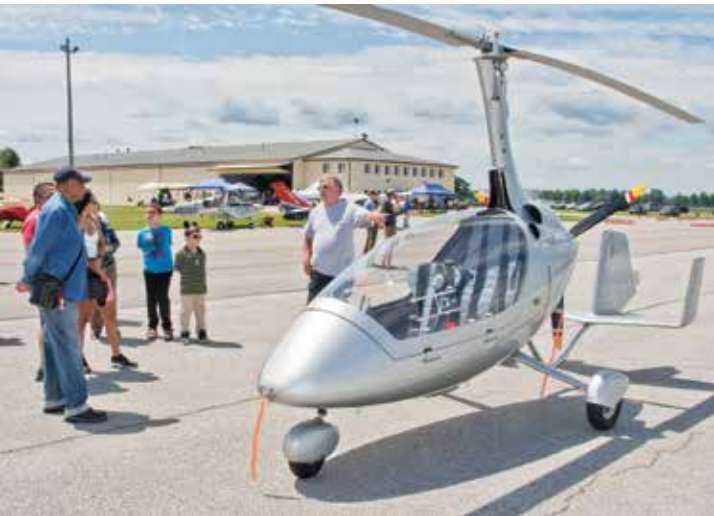
An experimental airplane owner points out the unique differences and opportunity to experience flying this plane.