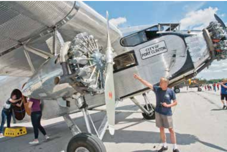
The Ford Tri-Motor is inspected by interested visitors Saturday at Discover Aviation Day at the Lorain County Regional Airport.

day fly-in event saw hundreds from the Lorain County community discover, explore, and experience the world of General Aviation. Over 70 youth aged 8-17 received free Young Eagle flights for an experience of a lifetime. The air-