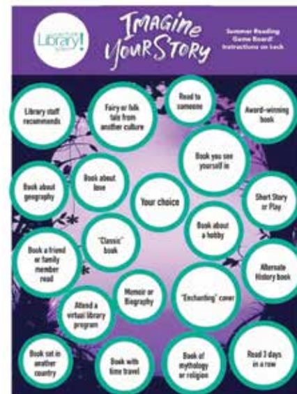
Summer Reading Game Board

Please remember you have to register if you want to be eligible for prizes.