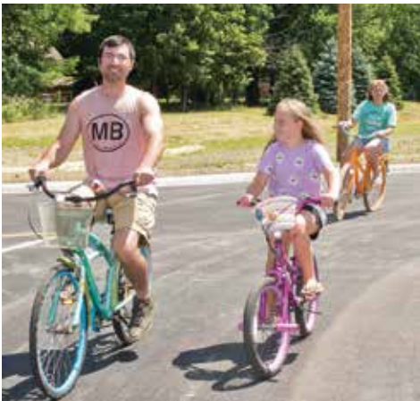
Cyclists take the first lap on the new roundaout.

Mayor Corcoran also thanked Don Mould's Plantation for the new roundabout planting and commended members of the Community Garden for their commitment to garden upkeep.