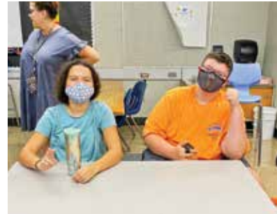
First day of school at Ranger High Tech Academy! Our students are excited and ready to learn! #RangerSTRONG