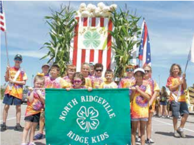
The North Ridgeville 4H Ridge Kids