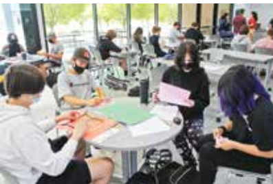
Last week featured great collaboration and project-based learning among RHTA high school students at the LCCC Ridge Campus! #RangerSTRONG