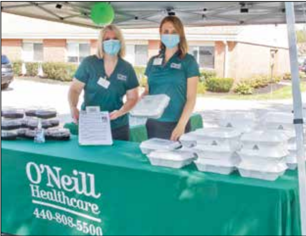
Almost 100 guests attended the Drive Thru Lunch and Learn presented by O'Neill Healthcare North Ridgeville.